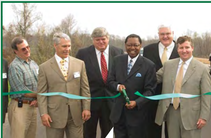
Mayor "Kip" Holden leading the Burbank Drive - Segment 2 ribbon cutting ceremony on December 18, 2008.