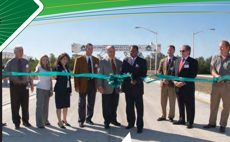
Mayor "Kip" Holden marks the official opening of Veterans Memorial Boulevard ribbon cutting ceremony on October 2, 2008.